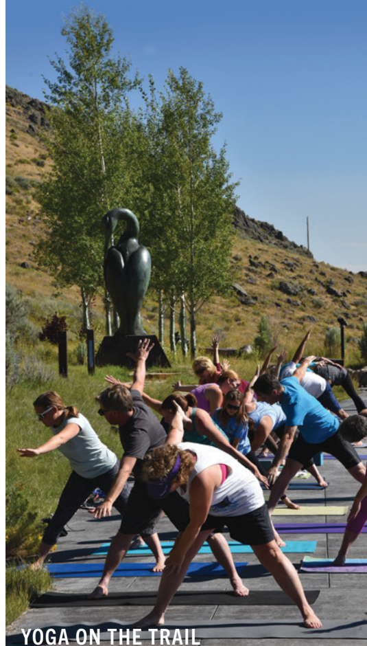
YOGA ON THE TRAIL

Teachers from several valley yoga studios lead free, weekly yoga classes on the Museum's Sculpture Trail between mid-July and late-August. Classes are B.Y.O.M. (bring your own mat).