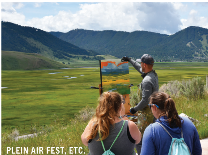
PLEIN AIR FEST, ETC.