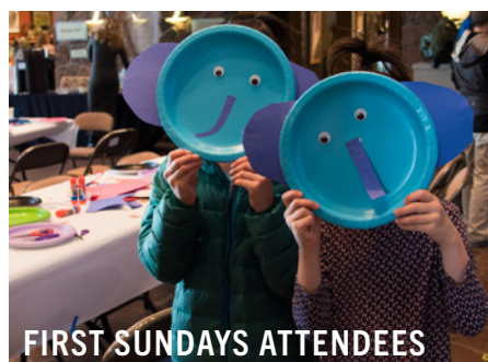
FIRST SUNDAYS ATTENDEES