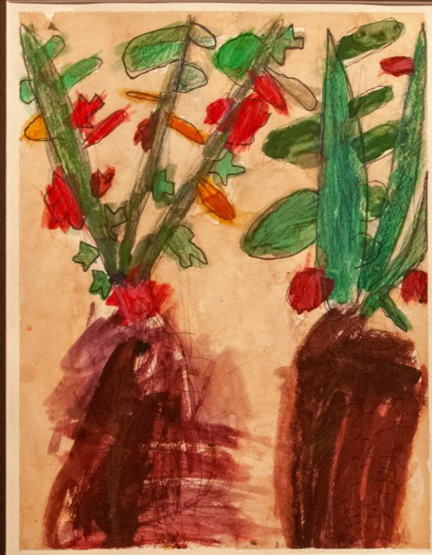
Evangeline Heindel Kindergarten Indian Paint Brush Mixed Media