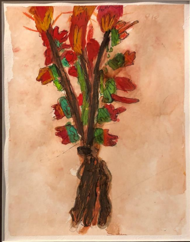
Chloe Ellett Kindergarten Dandelions Mixed Media