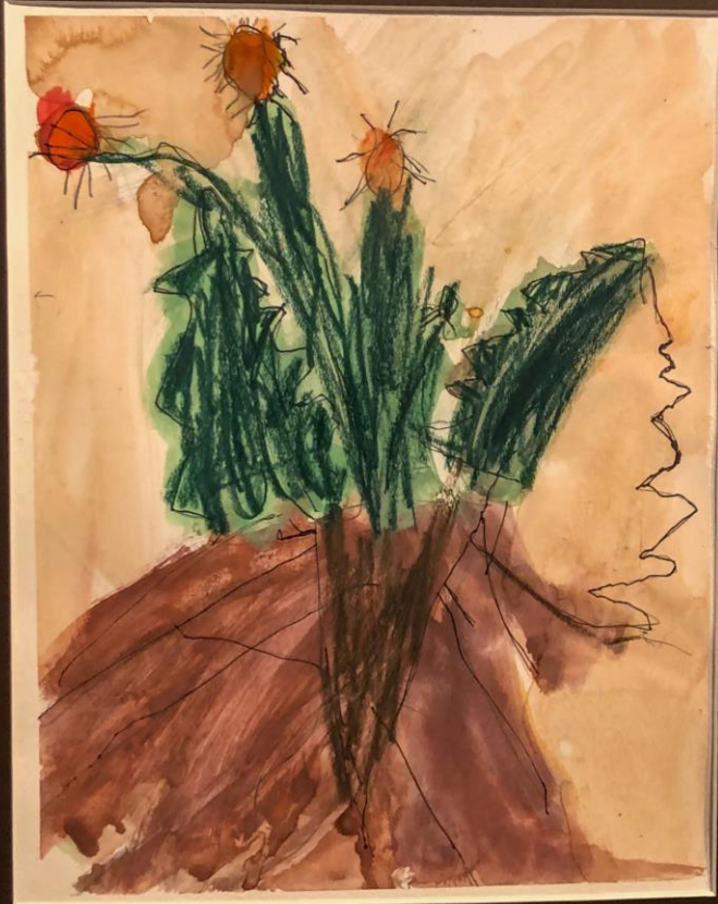
Jed Kunston Kindergarten Indian Paint Brush Mixed Media