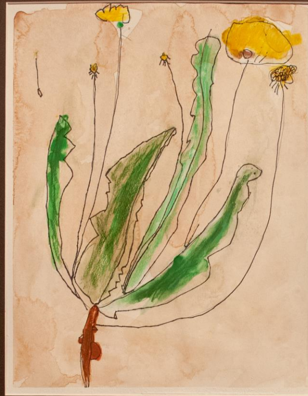
Sophie Floyd Kindergarten Indian Point Beach Mixed Media