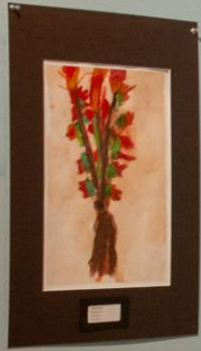
Salvia purpurea & Sida Bambusa