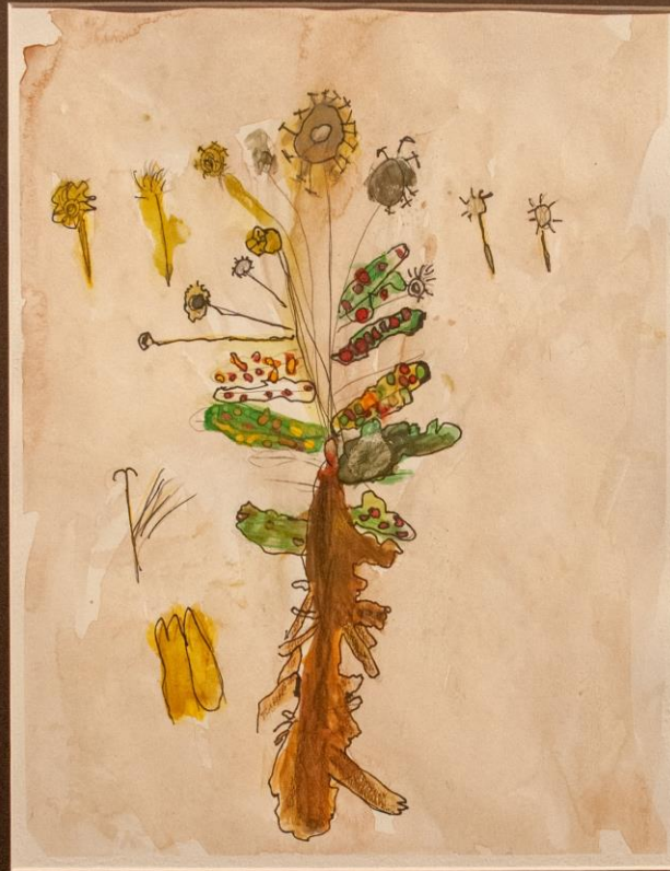
Chloe Ellett Kindergarten Indian Paint Brush Mixed Media