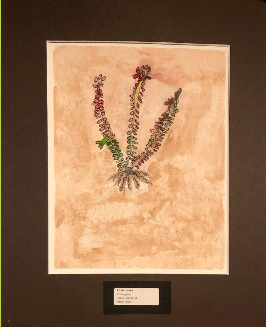
Lexie Perez Kindergarten Indian Paint Brush Mixed Media