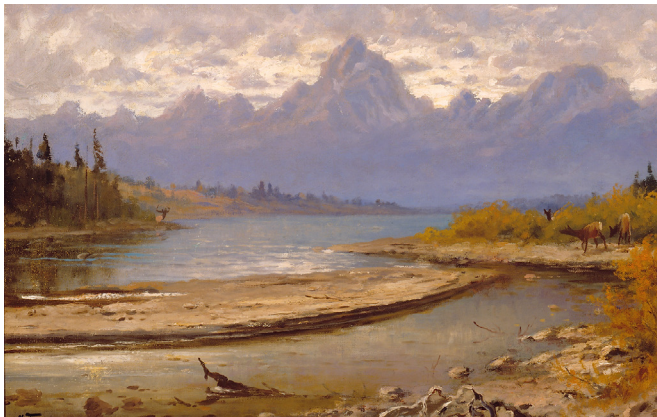
John Fery, Jackson Lake and the Tetons —detail, c. 1900. JKM Collection®, National Museum of Wildlife Art.